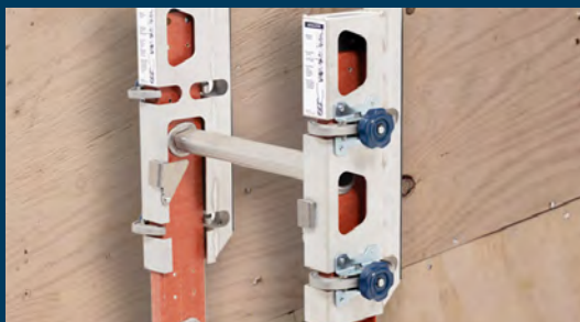
Dual Clamping System