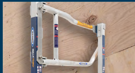
Accessory Gate Option